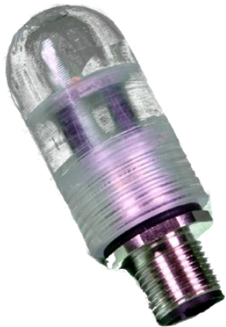
Actual size shown SB-011QD LED strobe